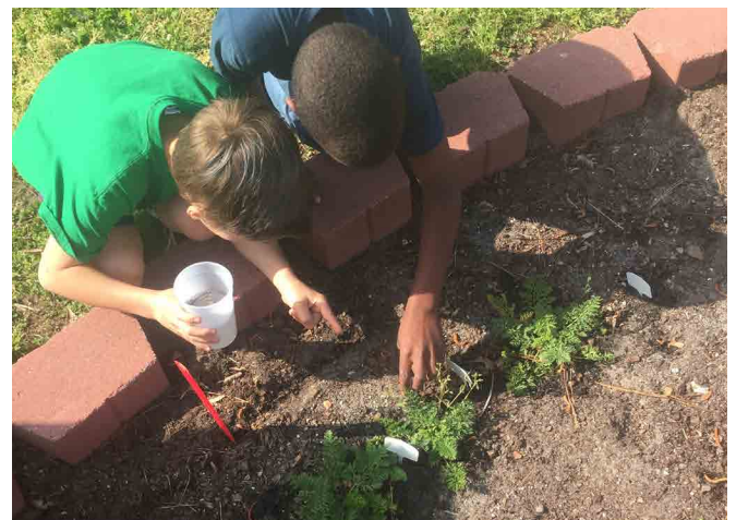
FIGURE 4-4 Youth planting and caring for their seeds develop responsibility and respect for nature.