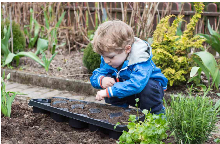
FIGURE 4-3 Young children love planting seeds

Examples: kale, collards, tomatoes, peppers, eggplant,