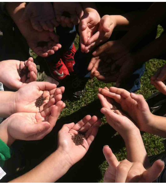
FIGURE 4-2 Let students explore seeds before planting