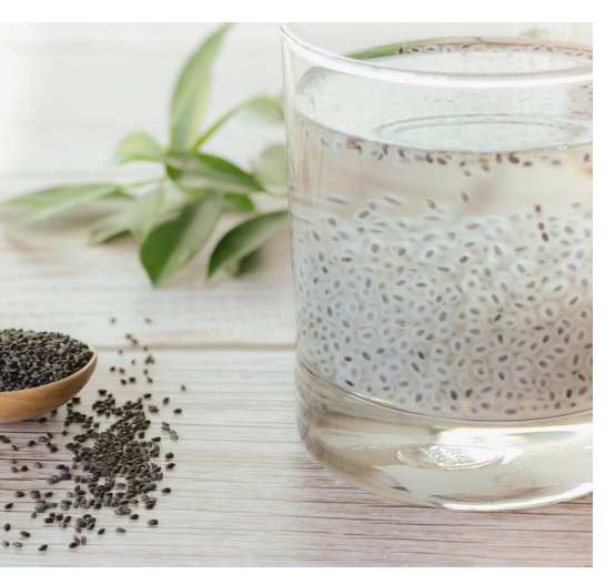
FIGURE 3-2 Basil seeds will start the germination process by forming a gelatinous coat when exposed to water