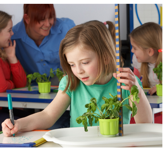
FIGURE 3-3 Youth can plant their basil seedlings and record the growth