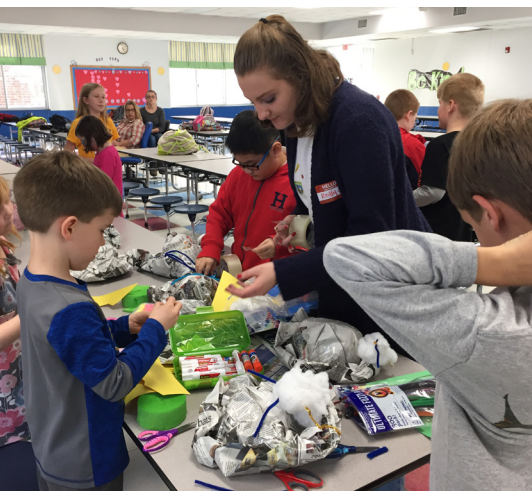
FIGURE 1 Making garden hats using the Junior Master Gardener curriculum

Starting an afterschool garden club has so many rewards when you connect teenagers to teach younger kids!