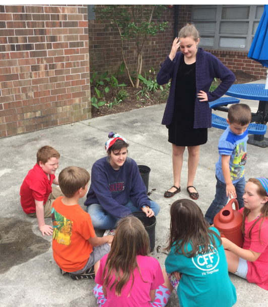
FIGURE 3 Having a variety of activities creates interest in gardening