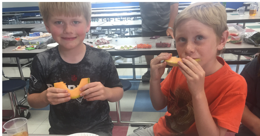
FIGURE 5 Kids in the afterschool program loved healthy snacks from the garden!

anyone would want to take it home to eat, Figure 5 . Almost all the students' hands shot up, and they each began to plea, saying they wanted to take it home and show their parents. We hope that you can create a program that equally inspires your students, as well as encourages them to adopt the principles of healthy living and farm-to-table eating.