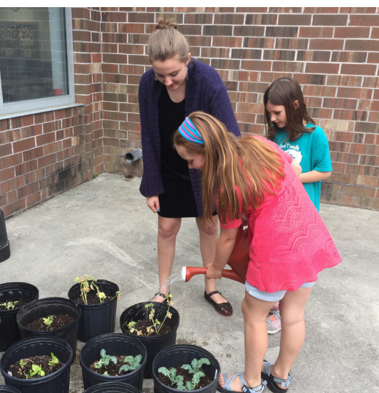
FIGURE 4 Gardening in containers worked well for the afterschool club

younger kids satisfied. We began our garden on the 4th week, the weeks leading up to this we used our lessons to prepare them for the garden care, and to teach them the basics of gardening. Then on our 4th meeting we planted all of our seedlings and seeds, we used containers because the school was not ready to commit to a gardening plot, Figure 4 . Containers worked extremely well for us, providing a way for us to establish and maintain a garden. My sister and I lived in close proximity to the school so we decided to water the plants ourselves, simply to ensure the students would have the most successful harvest possible. We continued